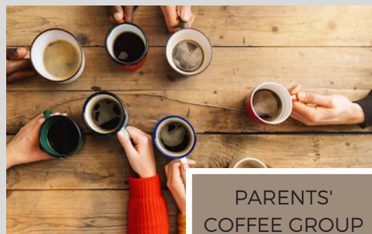
PARENTS' COFFEE GROUP

www.teanautoylibrary.setls.com.au teanautoylibrary@gmail.com