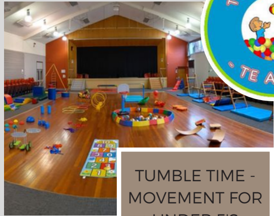
TUMBLE TIME - MOVEMENT FOR UNDER 5'S

A wonderful community resource for children under the age of 5. Enjoy some fantastic movement, social time, and play equipment.