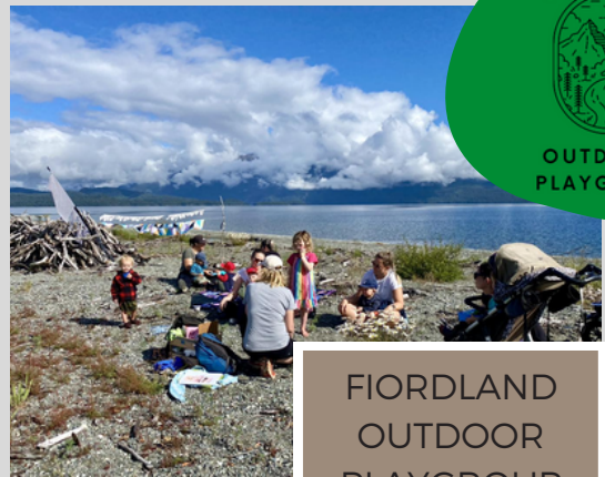
FIORDLAND OUTDOOR PLAYGROUP