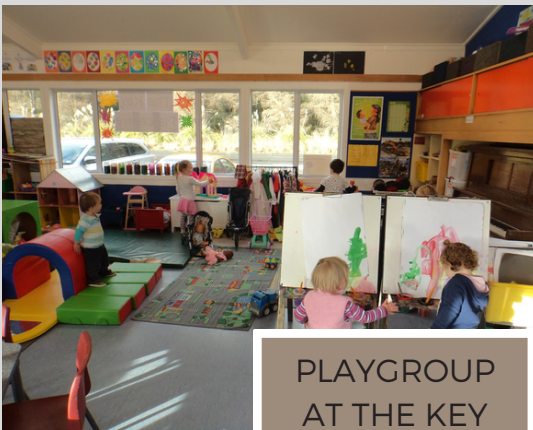
PLAYGROUP AT THE KEY

There are a huge number of local groups who run weekly activities (some only during school term time) which you can bring your babies or children to and join in with. Each month Fiordland Families Network summarises these events in their newsletter's 'what's on' column, and on the FFN website. Regular groups and activities are introduced below. Visit Te Anau Events website to see what local events are coming up and if any of them are of interest to your family: www.teanauevents.co.nz