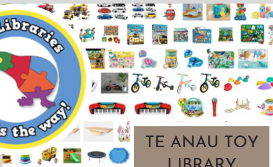
TE ANAU TOY LIBRARY

Loans a huge wide range of toys, including bikes, water play, puzzles, educational toys, dress-ups, roll play, and board games, and more.