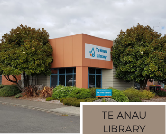
TE ANAU LIBRARY

As well as great kids and youth books, the Te Anau Library hosts a range of afterschool activities and clubs, preschool activities, and holiday activities.